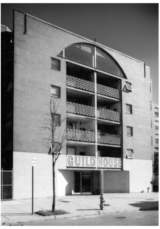
Fig. 4- Guild House, Venturi and Rauch, Cope and Lippincott, Associates, Philadelphia, 1960-63

it. However, the historic allusions of the facade of the Guild House are owed to "appliqué" ornamental features, e.g., string courses, ornamental grills, etc., that are, the authors contend, quite "explicit" as external adornment. They are ornamental, extraneous, and "look it." Although the Guild House is neither a Renaissance Palazzo nor a giant Order, its historic allusions do not purport to be anything but allusions in substance as well as image. It is in this "explicit" confession to representational allusion, in this venerated correspondence of "image" to "substance," that all the critical difference is said to lie.