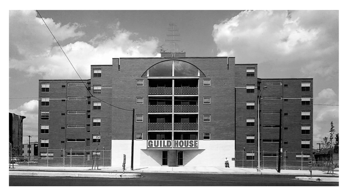
Fig. 2- Guild House, Venturi and Rauch, Cope and Lippincott, Associates, Philadelphia, 1960-63

they are "ordinary and conventional but do not look it" (Venturi and Scott Brown 1972: 90-91). The analysis extends in the same vein to the exterior facade of both buildings. For instance, the windows of the Guild House, we are told, "Look like, as well as are windows" (Venturi and Scott Brown 1972: 91) (fig. 3). In Crawford Manor the windows appear as "modulated" voids set between and in contrast to the solid structural elements, marking the transition of interior and exterior spaces (fig. 4). They are , in other words, windows, "But do not look it" (Venturi and Scott Brown 1972: 91).