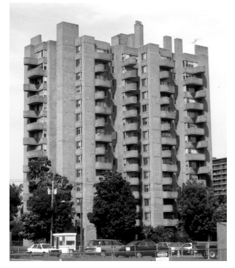
Fig. 1- Crawform Manor, Paul Rudolph, New Heaven, 1962-66

techniques, construction material, and the articulation of the facade. The construction technique and materials of both buildings are "ordinary and conventional" (Venturi and Scott Brown 1972: 90), but the two buildings express these facts very differently.1 The structure and the construction materials of the Guild House "ordinary and conventional and look it" (Venturi and Scott Brown 1972: 90). In Crawford Manor they "more advanced appear technologically and more progressive spatially," i.e.,